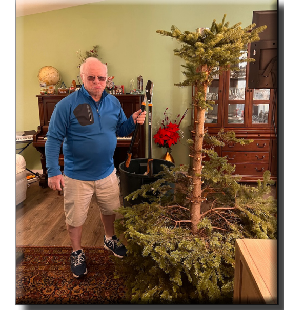
RFNL January 2022 Page 13