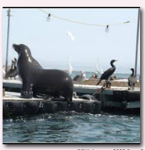
RFNL January 2022 Page 5

to travel. Sea Lions are trained to retrieve submerged objects. Both can find and capture enemy divers.