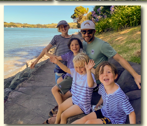
RFNL January 2022 Page 14