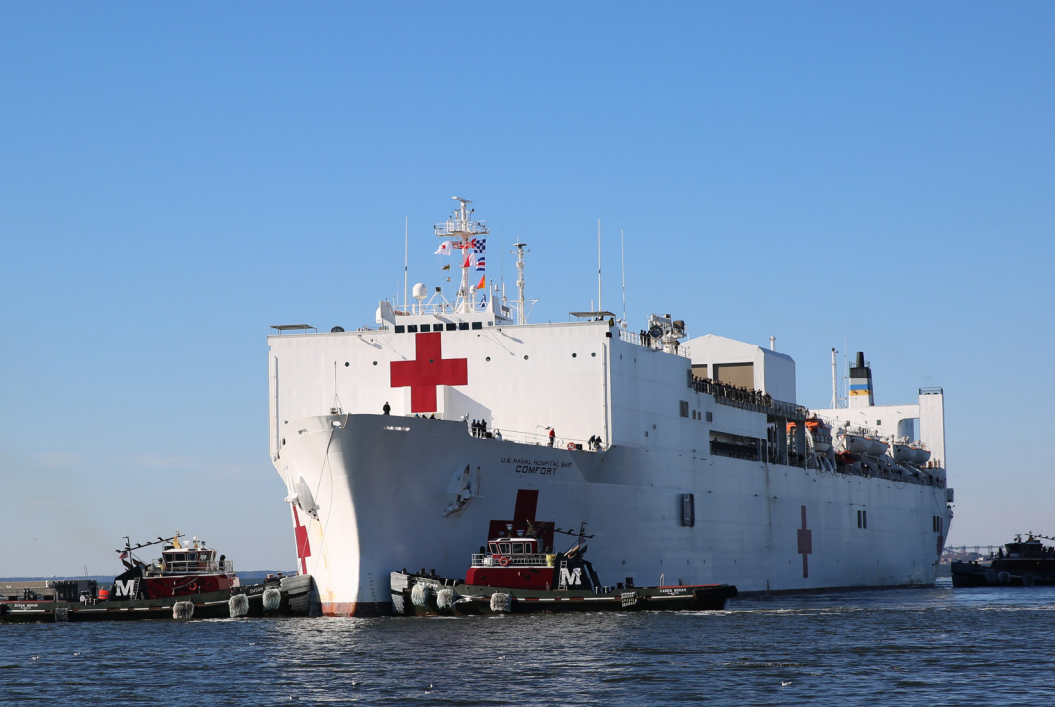
NORFOLK, Va. (December 18, 2018) The hospital ship USNS Comfort returns to Virginia after completing an 11-week medical support mission to South and Central America. Comfort will again deploy to the region June 14, 2019, for a 5-month medical assistance mission.

mission stops in Colombia, Costa Rica, Dominican Republic, Ecuador, Grenada, Haiti, Jamaica, Panama, Saint Lucia, St. Kitts and Nevis, and Trinidad and Tobago.