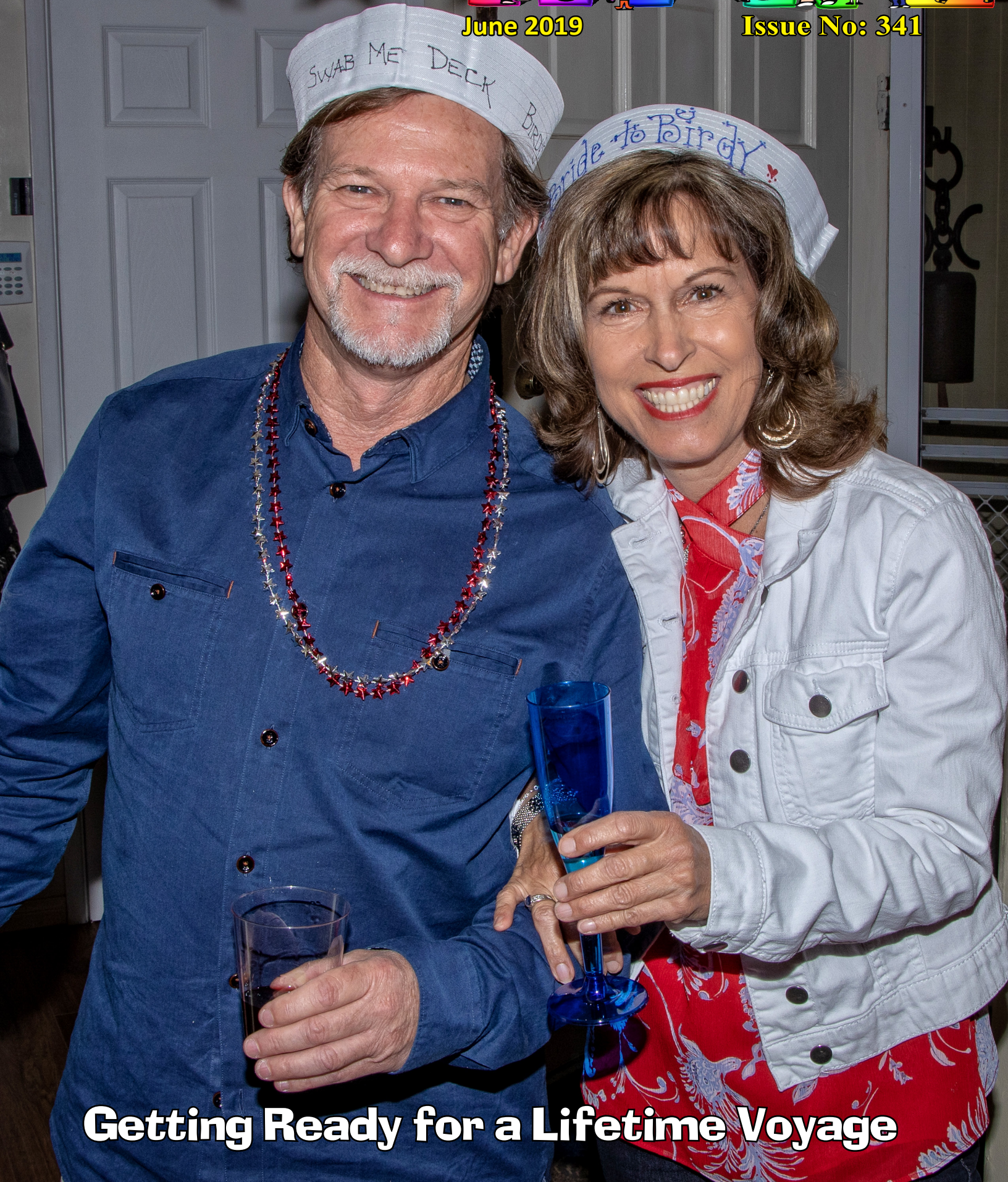
Getting Ready for a Lifetime Voyage