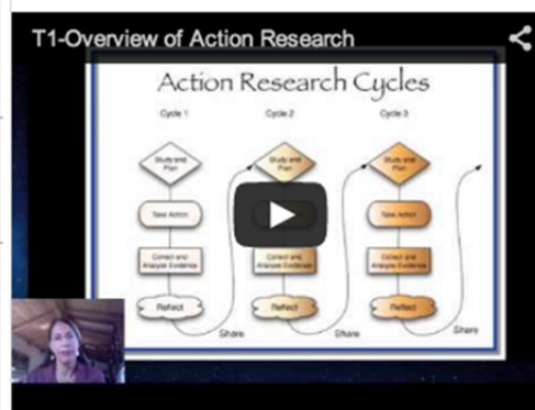
T1: Overview of Action Research # Sep, 2013