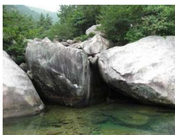
5. After we finished the hike we went swimming in this small pool fed by a natural spring.