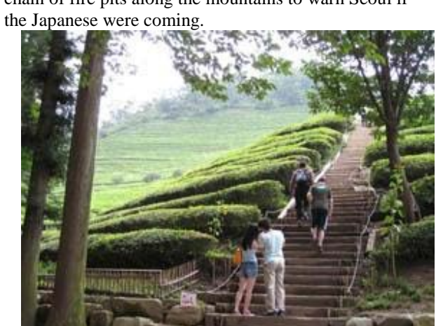
3. OK, this was a tea plantation up in the mountains, which was cool.