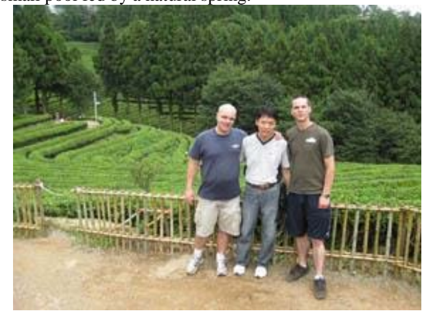
6. The tea plants grow best in the acidic mountain soil, so they terrace the mountainside to grow all the row