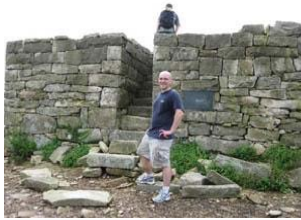
2. This used to be a big fire pit which was a part of a chain of fire pits along the mountains to warn Seoul if