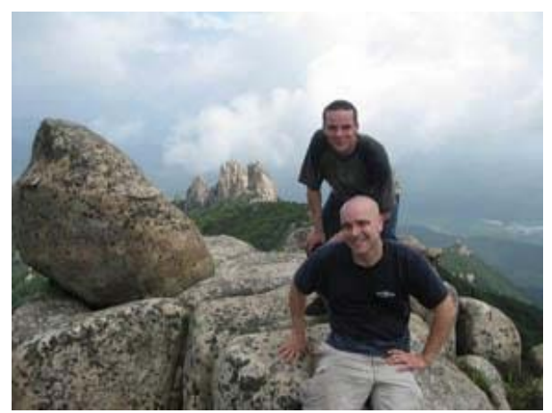
1. Hiking in South Cholla Province