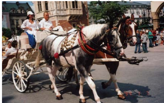
A Town Square in Poland