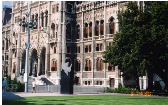
Parliament building in Budapest, Hungary