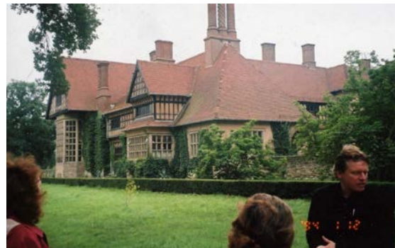
Cecilien Palace, Potsdam, where Truman, Churchill and Stalin met, 1945